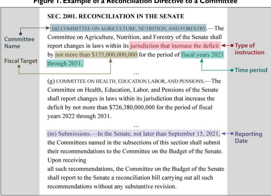
Figure 1. Example of a Reconciliation Directive to a Committee